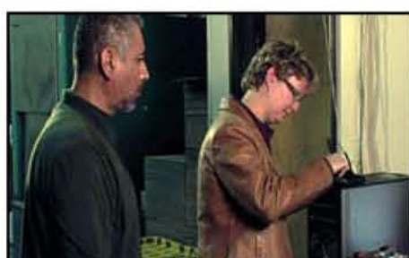
STEP 6 Verification of delivery to funeral home