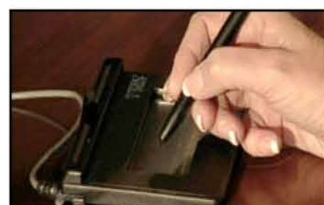
STEP 7 Final disposition identification documentation by family

www.cremationsafeguard.com • 877-447-8040