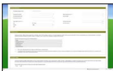
STEP 1 Statistics

Full Circle Protection that starts and ends with identification.