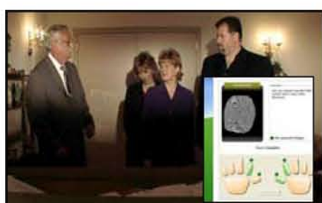
STEP 2 Identification by the family