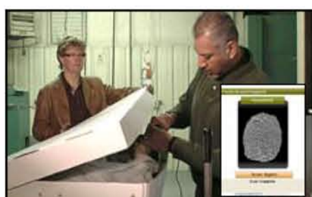
STEP 4 Identification at crematory