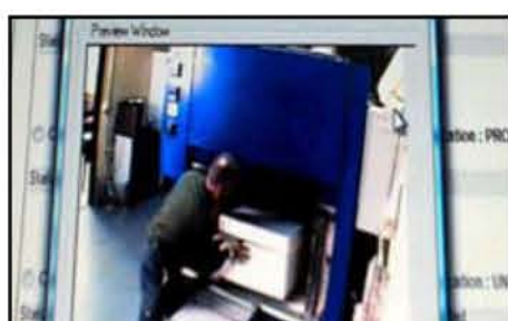
STEP 5 Closed caption video of the cremation thru the locking process